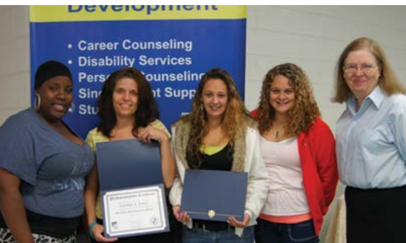
Participants in ATC's first Professionalism Series last spring were recognized with certificates of completion.