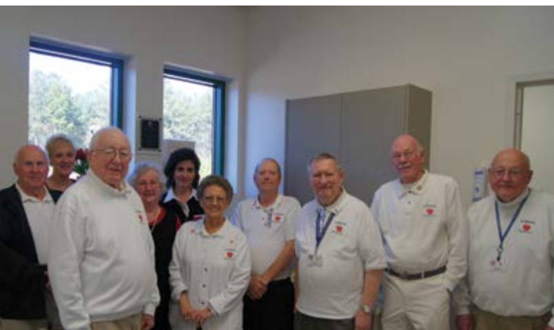
ATC's Cardiac Care Lab was dedicated in honor of the Aiken Mended Hearts Chapter 294 in February for the group's support of ATC health sciences students.