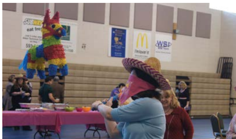
Faculty and staff took part in the Foundation's Give Mas! Live Mas! Family Giving Campaign festivities.